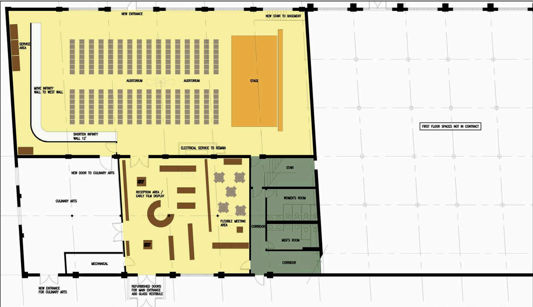
Plan Diagram: Auditorium arranged for Performance and Reception Area arranged as Film Center Gallery and flexible meeting room